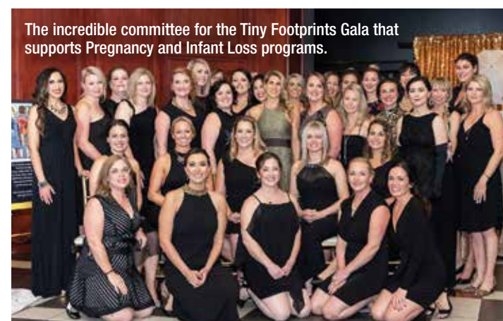
The incredible committee for the Tiny Footprints Gala that supports Pregnancy and Infant Loss programs.