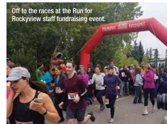
Off to the races at the Run for Rockyview staff fundraising event.