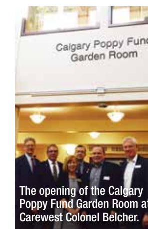
The opening of the Calgary Poppy Fund Garden Room at Carewest Colonel Belcher.