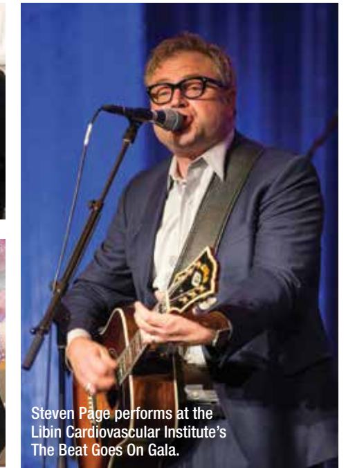
Steven Page performs at the Libin Cardiovascular Institute's The Beat Goes On Gala.