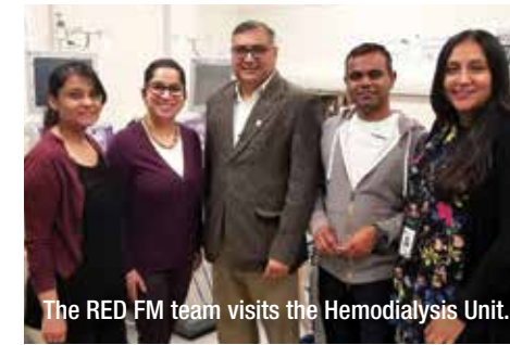
The RED FM team visits the Hemodialysis Unit.